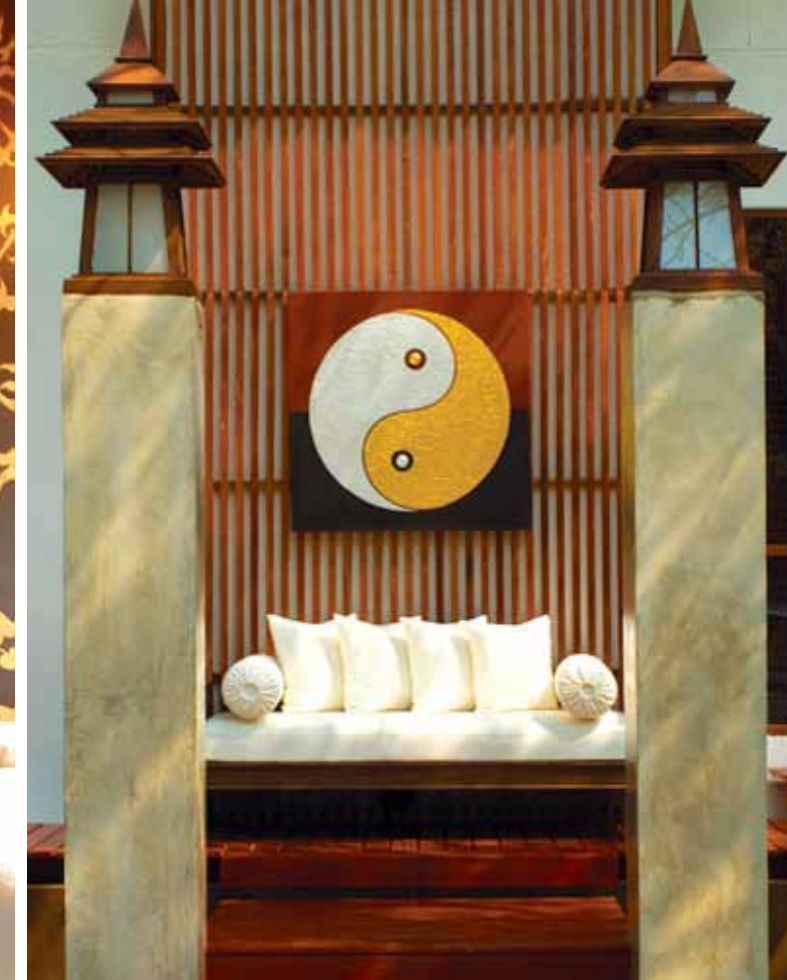
"King of Oasis" Massage at Oasis Spa Bangkok

"...WE SEE AN INCREASED NUMBER OF MEN'S PRODUCTS AND THIS HAS BEEN WELL ACCEPTED IN MANY SOCIETIES. MEN ARE ALSO BECOMING INCREASINGLY INTERESTED IN SPA TREATMENTS, NOT ONLY MESSAGES, BUT ALSO FACIAL TREATMENTS, BODY SCRUBS, MANICURES, AND PEDICURES..."